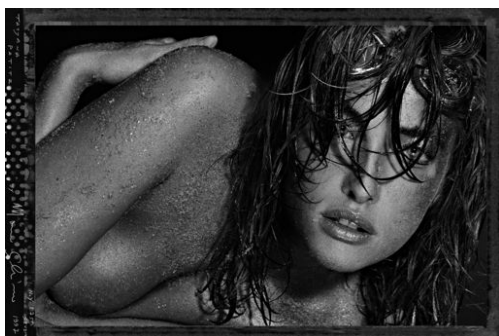
TATIANA PATITZ, NEW YORK, 1987