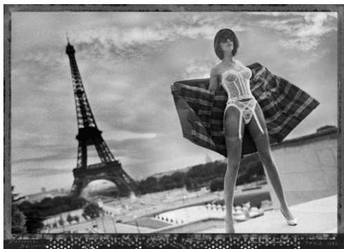
STEPHANIE SEYMOUR, PARIS, 1982