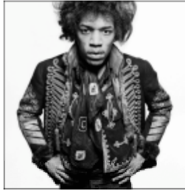
Jimi Hendrix