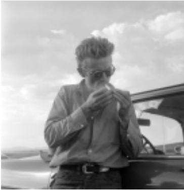
James Dean